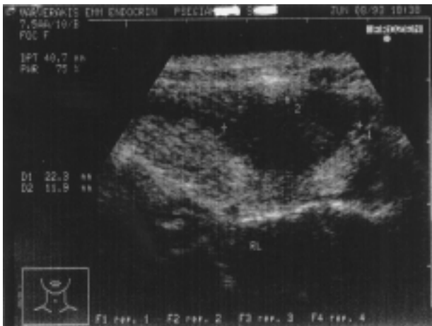
Figure 1. Hypoechoic nodule, 22x11 mm. in size with irregular contour. It was a papillary carcinoma.